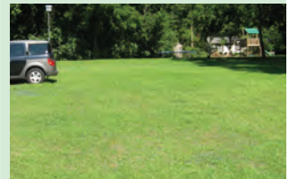
After installation - grass grows through quickly