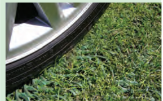
Mesh after installation