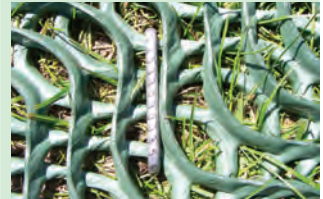
Secured with U-pins